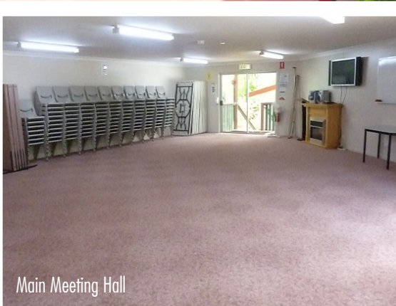
Main Meeting Hall